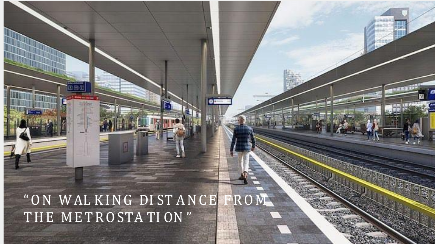
“ON WALKING DISTANCE FROM THE METROSTATION”